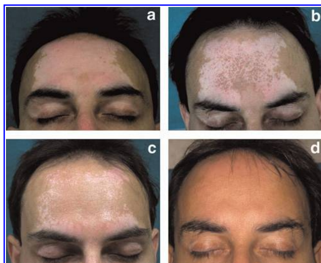
FIG. 1. (a) Facial vitiligo before treatment with MEL + 0.1% tacrolimus + vitamin E; (b) repigmentation after 4 weeks, (c) 8 weeks, and (d) 12 weeks.

Treatments were well tolerated, and at the 120-day follow-up visit adverse events related to therapies were not reported.